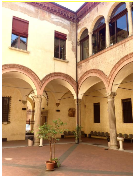
Palazzo Paleotti: the site of the Chair in Bologna

In specific, the research areas selected by the Chair concentrate on: Islamic studies, Islamic law, Islamic art, Arab literature, historical relations between Italy and the Arab world, Islamic heritage in the Italian libraries, Arabic language: its diffusion in Italy, its teaching and the comparison between Italian and Arab literature.