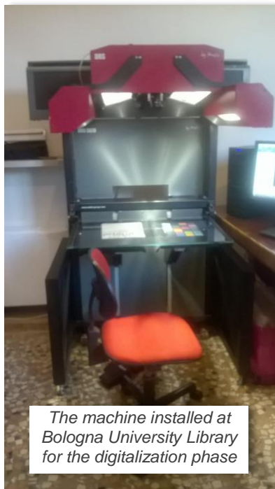
The machine installed at Bologna University Library for the digitalization phase

فهرس المخطوطات الإسلامية في مكتبة جامعة بولونيا المركزية (الجزء الأول)